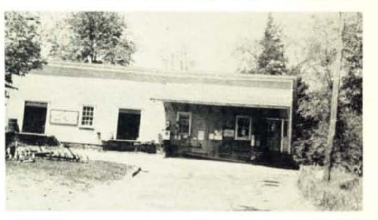
Items around the Hanford Hardware Store and signs on the wall give us clues to the things the Hanfords sold.

collect objects to reflect the diverse jobs people held, but the mill site also illustrates Lewis Quick's quote. The museum site includes 16 historic buildings, all original to the mill property, and they reflect the Hanfords' many